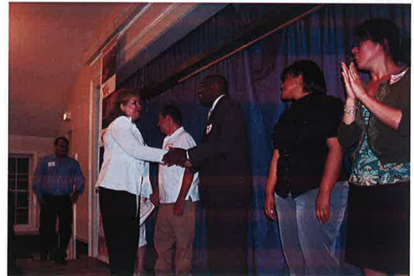
Students receive congratulations from their instructors at the June 2009 graduation ceremony.