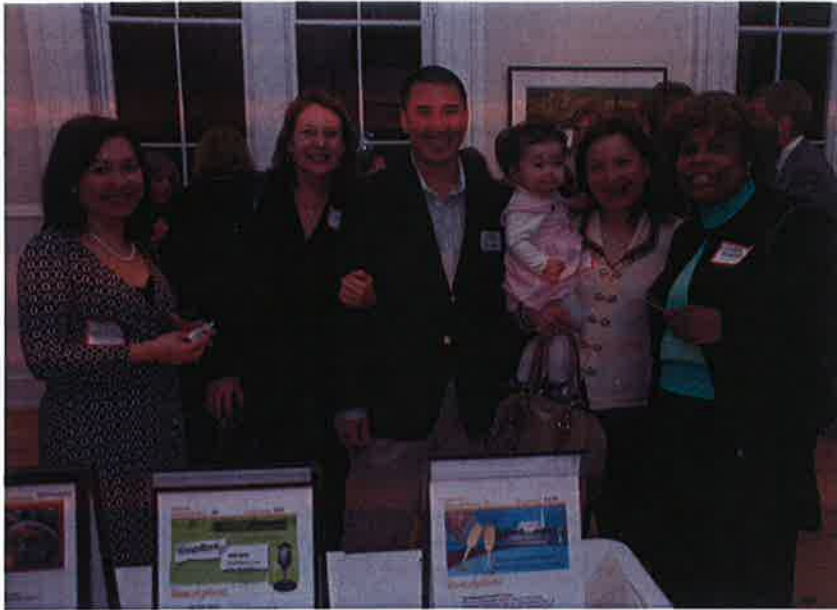
Friends of all ages enjoy a good time at the 2009 Wine & Chocolate fundraiser.