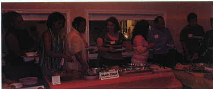
Students and supporters enjoy a meal together before the June 2009 graduation ceremony.

City of Alexandria, Community Partnerships Fund The Boeing Company Charitable Trust The Morris & Gwendolyn Cafritz Foundation ExxonMobil Foundation Fairlington Presbyterian Church Freddie Mac Community Relations Freddie Mac Foundation Matching Gifts Giving Circle of Hope Philip L. Graham Fund The Meyer Foundation The Claude Moore Charitable Foundation The MITRE Corporation National Cooperative Bank The Phase Foundation Providence Presbyterian Church The Hattie M. Strong Foundation Tronix Country LLC United Way of the National Capital Area Washington Forrest Foundation