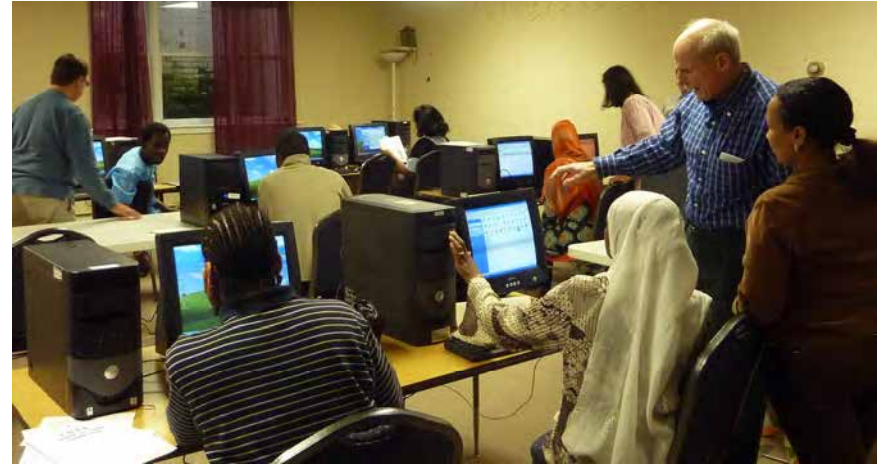
Students learn to set up their new home computers on Distribution Day.

Spring 2010 graduates reported the following outcomes as of their 12-month followup survey: