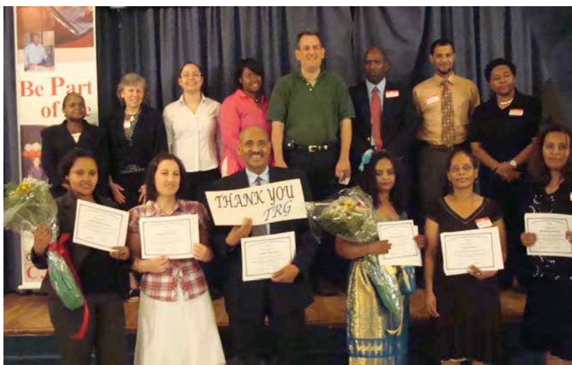
June 2010 graduates pose with instructors and guests and proudly display their certificates of achievement.