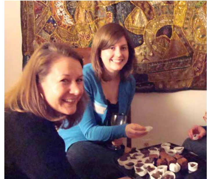
CORE supporters enjoy a good time (and chocolate!) at the 2010 Wine & Chocolate fundraiser.