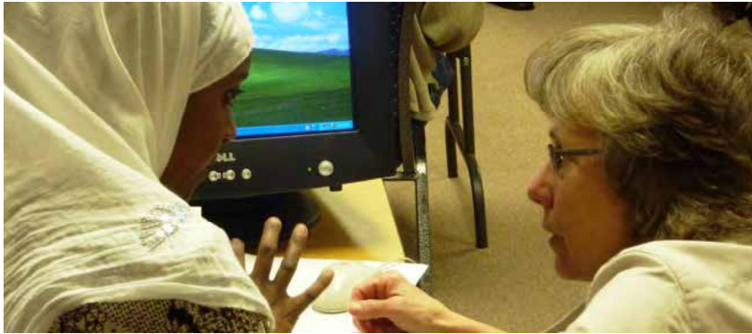
A student works one-on-one with an instructor during computer distribution.